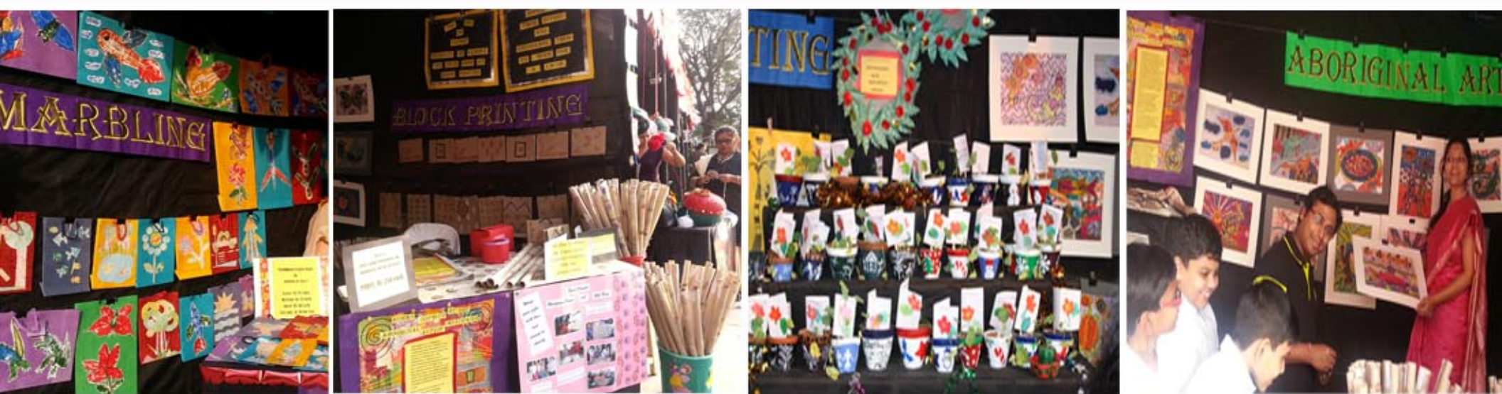
Children worked hard to produce the attractive products