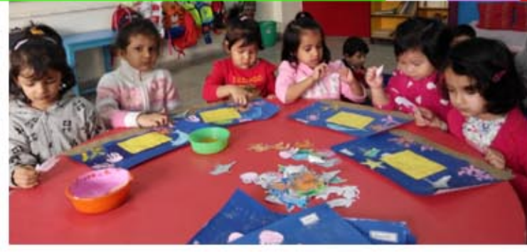
Making a collage of the underwater creatures.