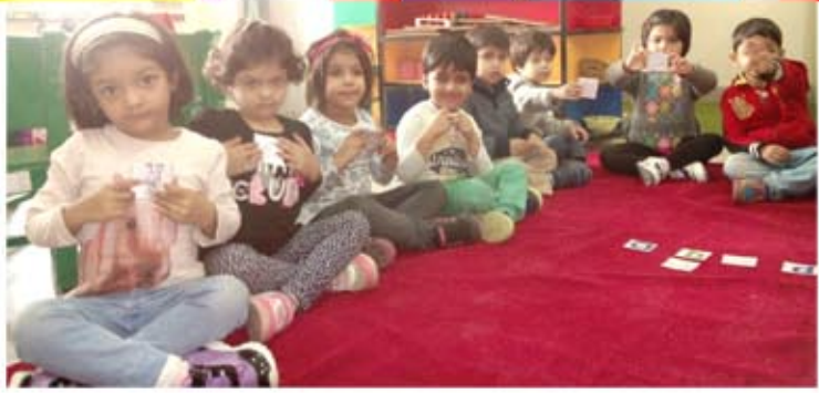
Conducting a language activity on phonic sounds.